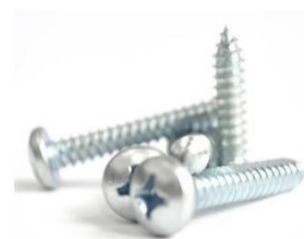
Stainless Steel Screws